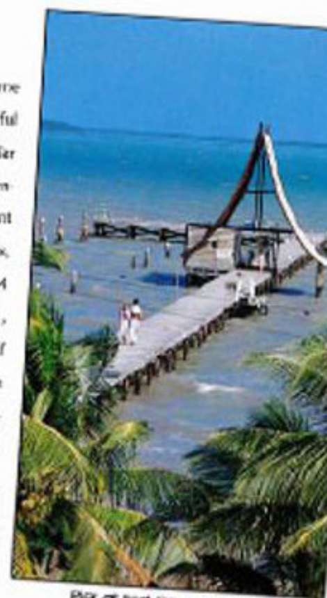
Pier at Fort George Hotel

B elize will continue to be a wonderful serpentine to travelers familiar only with other parts of Cen tral America. It is different for a variety of reasons. Granted home rule in 1964 and independence in 1981, it has had a long tradition of stable government through its years as British Honduras. Its people are warm and friendly.